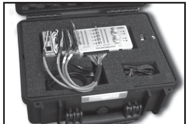
Figure 3: MAQ20 Demonstration Suitcase