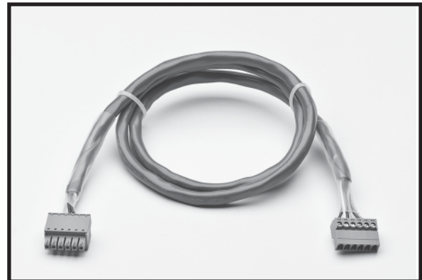
Figure 2: Backbone Expansion Cable