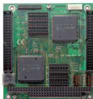
PCM-3643 4/8 RS-232 COM Port Module