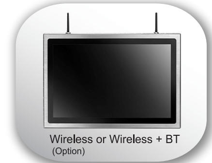
Wireless or Wireless + BT (Option)