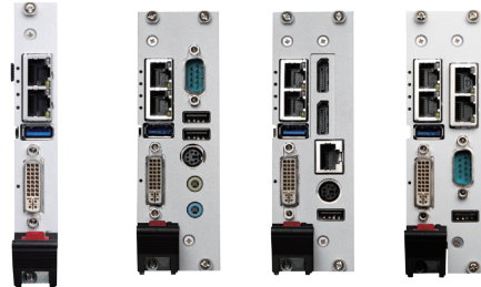
cPCI-3511(BL) cPCI-3511(BL)D cPCI-3511(BL)G cPCI-3511L