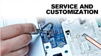
SERVICE AND CUSTOMIZATION

Sophisticated timeless design coupled with Winmate expertise in industrial computers and touchscreen not only offers you a top product at an attractive cost but also gives you a sense of technical superiority and the future. Winmate display modules are perfectly assembled in the clean room for easy further processing.