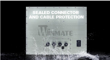
SEALED CONNECTOR AND CABLE PROTECTION

The display is highly resistant to cold temperatures, wet fingers, and dusty conditions. Plus, the protective glass serves to protect the display against sharp foreign objects, meaning the screen is still operable even with scratches on the surface.