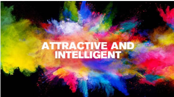
ATTRACTIVE AND INTELLIGENT

IP67 protection means these displays can be installed in the harshest industrial environments.