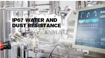
IP67 WATER AND DUST RESISTANCE