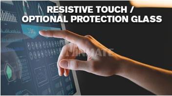
RESISTIVE TOUCH / OPTIONAL PROTECTION GLASS

The display fully complies with IP67 water and dust resistance to survive splashing conditions during stringent cleanup processes and strict hygiene demands in the Food, Beverage, and Pharmaceutical industries.