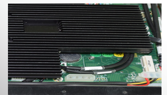
Thermal solution and exclusive i-cooling system design