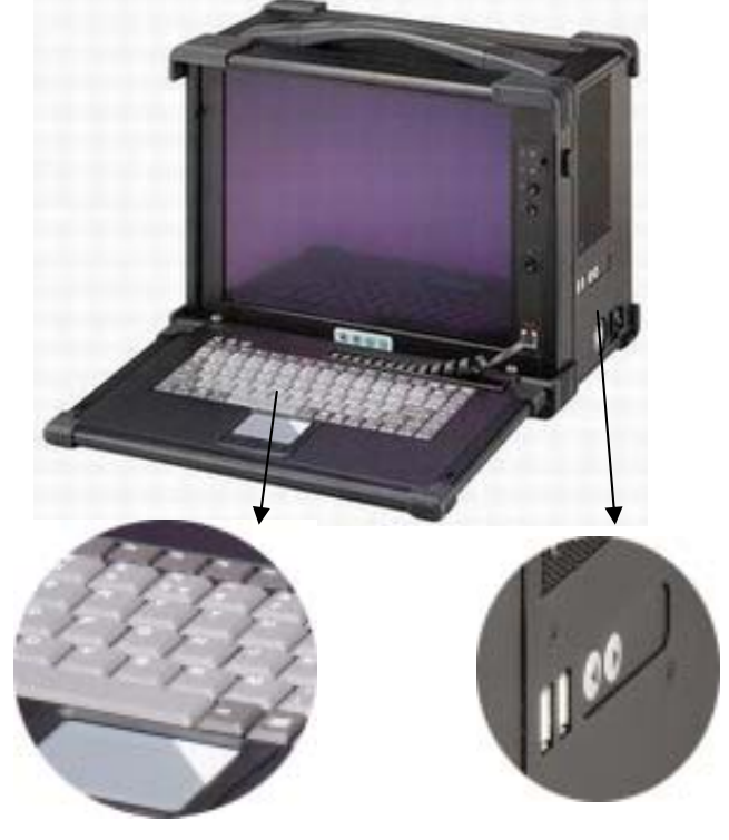
87 Keys membrane keyboard