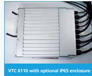
VTC 6110 with optional IP65 enclosure