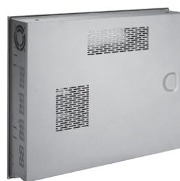
▲ Less screw design