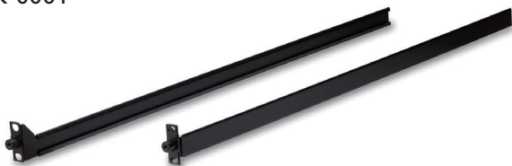
Standard Installation 2K-0001