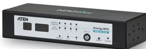
● EC1000 front view