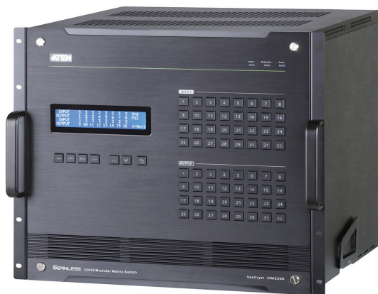
VM3200 Front view