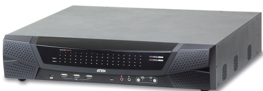
RCM464V Front View